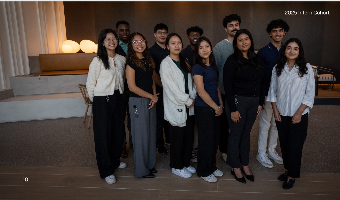
2025 Intern Cohort

Project Onramp: For the second year, Acadia partnered with Project Onramp — a Life Science Cares program that creates paid summer internships for under-resourced and first-generation college students — to help elevate talented students from underrepresented populations and expand their access to meaningful opportunities in the life sciences.